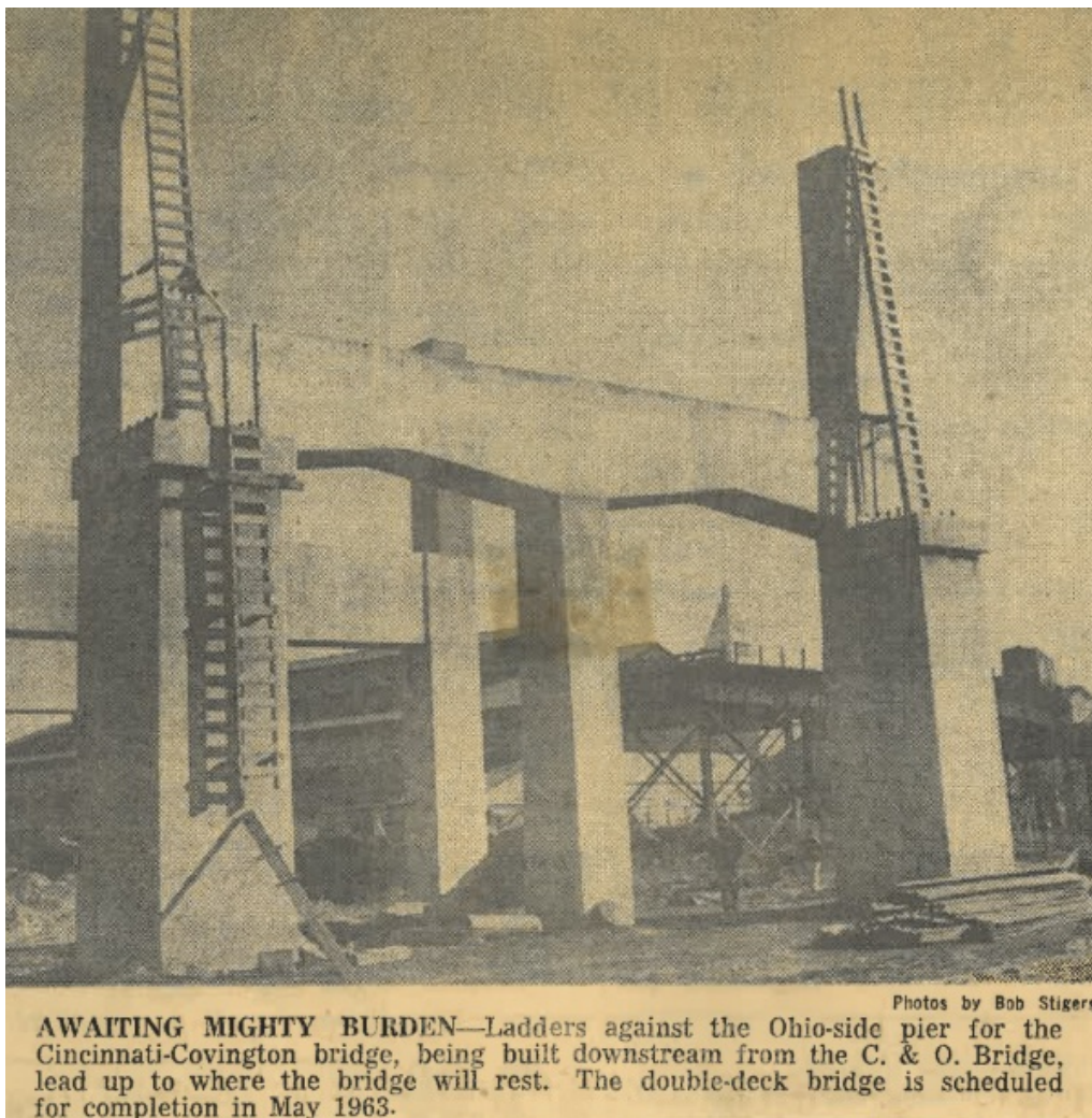
AWAITING MIGHTY BURDEN —Ladders against the Ohio-side pier for the Cincinnati-Covington bridge, being built downstream from the C. & O. Bridge, lead up to where the bridge will rest. The double-deck bridge is scheduled for completion in May 1963.