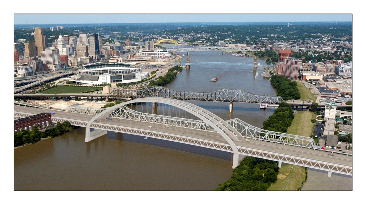
Alternative 1: Tied Arch Bridge

The Final 3 Bridge Alternatives are depicted below. The selection of the new Ohio River Bridge will be based on public hearing comments and results of the Bridge Type Study. The final bridge type will be determined in the next phase of the project.