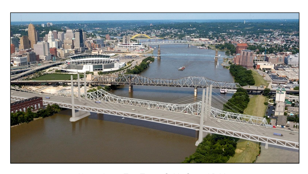
Alternative 3: Two Tower Cable Stayed Bridge