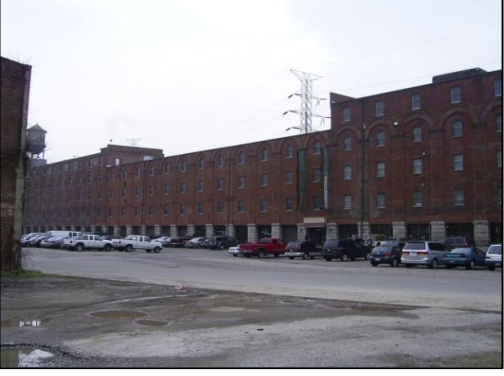
View of Longworth Hall

Feasible Alternatives E and I would directly impact the eastern section of Longworth Hall. Both alternatives would pass through 204 feet of the eastern end of the building, requiring that three, 15-foot, two 13-foot, and six 12-foot bays of the building be demolished. This affected section of the building is that portion which was previously altered by reducing its length by 150 feet in 1961, to allow for the supporting piers of elevated I-71/I-75. A five-story 30,000 square foot brick addition was then built onto the northeast corner.