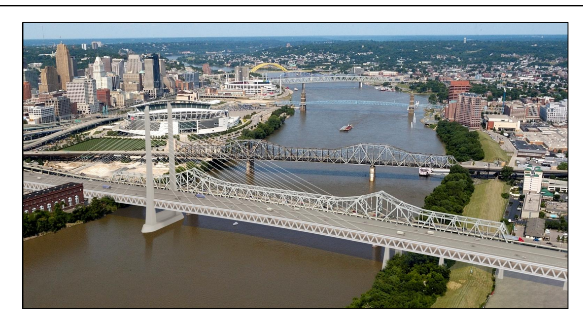
Alternative 6: One Tower Cable Stayed Bridge