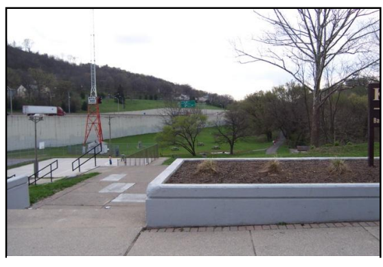
View of Goebel Park

Goebel Park would be impacted by widening the interstate. Goebel Park is 14.8 acres. Alternative E would take 3.7 acres, including a parking lot, a basketball court, and a walking path located on the west side of the park. Alternative I would take 1.9 acres of the park avoiding impacts to the walking path but would impact the parking lot and basketball court. A neighborhood pool, located in Goebel Park would not be directly impacted by either feasible alternative. The total acreage impacts to Goebel Park, including Kenney Shields Park, and