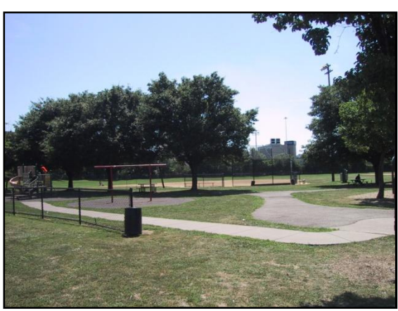
View of Queensgate Playground and Ball Fields

In Ohio, the Queensgate Playground and Ball Fields would be impacted by both Alternatives E and I. Alternative E would require 0.6 acres and Alternative I would require 0.9 acres along the southwestern edge of the property adjacent to I-75. Both feasible alternatives impact trees and parkland. Also, the proposed right-of-way of either Alternative E or I extend to the outfield area of the existing ball fields within the park. The Queensgate Playground and Ball Fields provide recreational opportunities for the West End neighborhood. Additional discussion of the Queensgate Playground and Ball Fields, including mitigation, is found in Section 6.5.5.